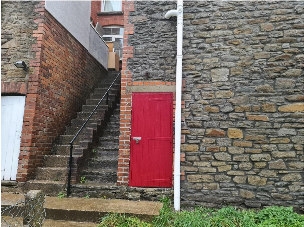
Example of Upper Steps