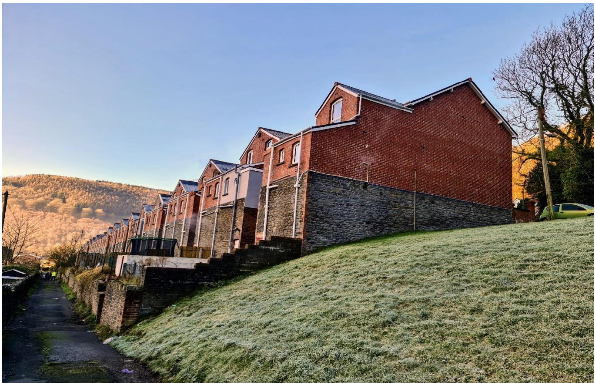
Rear Elevations of George Street.