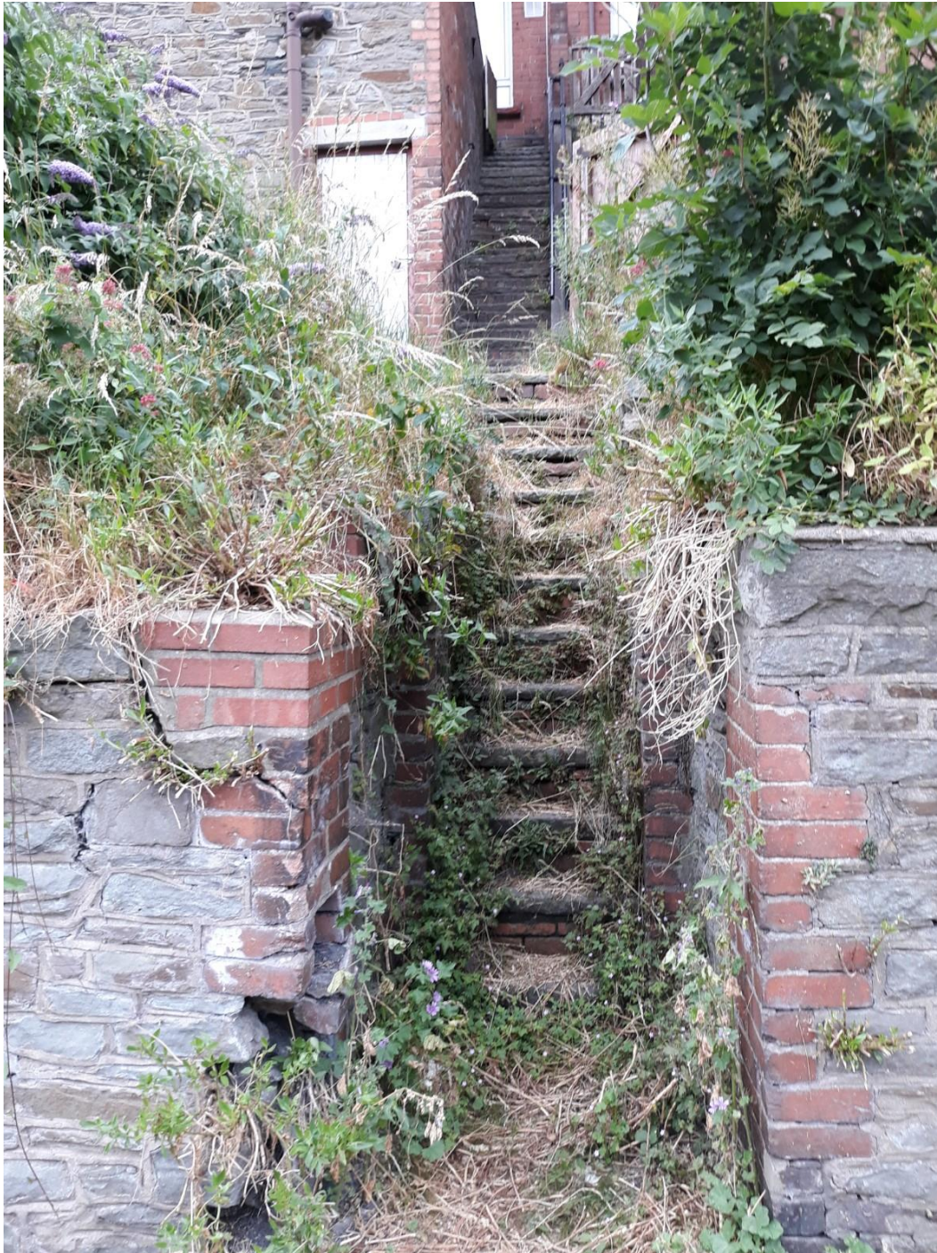
Example of Shared Lower Steps