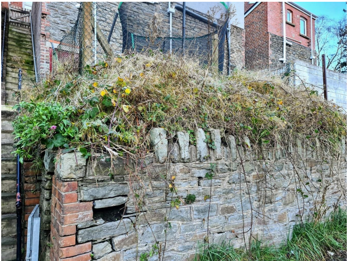
Examples of Rear Retaining Walls