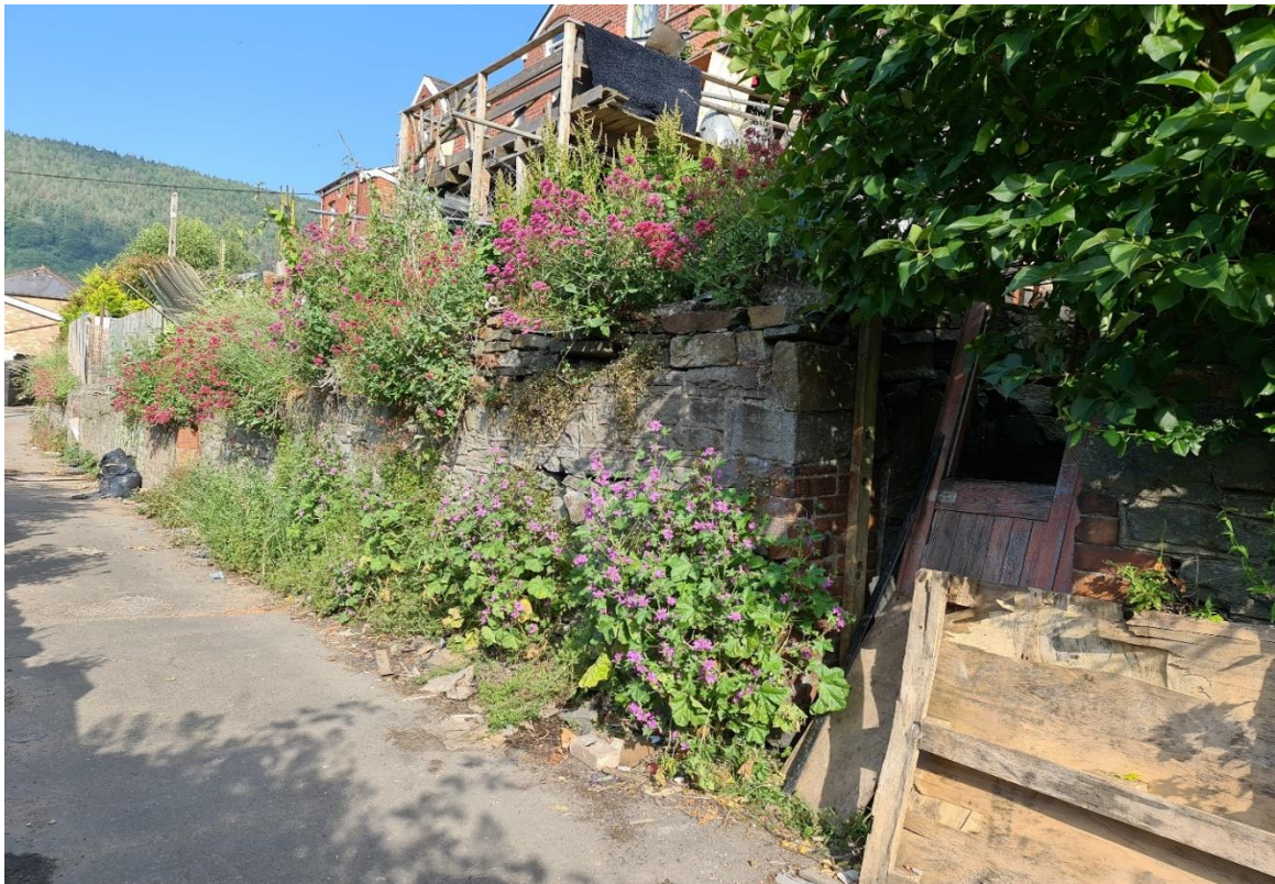
Examples of Rear Retaining Walls